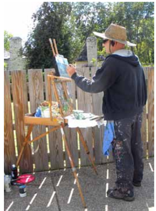
Artists from throughout the region have participated in past plein air events in Missouri's most historic town.